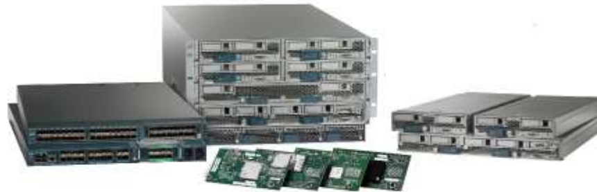
Figure 2: UCS Hardware

The UCS hardware components, which provide the platform for the FMCv, in the TOE have the following distinct characteristics: