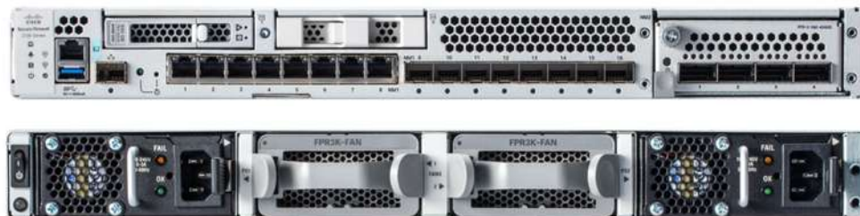
Figure 1: Cisco Secure Firewall 3100 Series Hardware (3105, 3110, 3120, 3130 and 3140)

The Cisco Secure Firewall 3100 appliances have the following distinct characteristics: