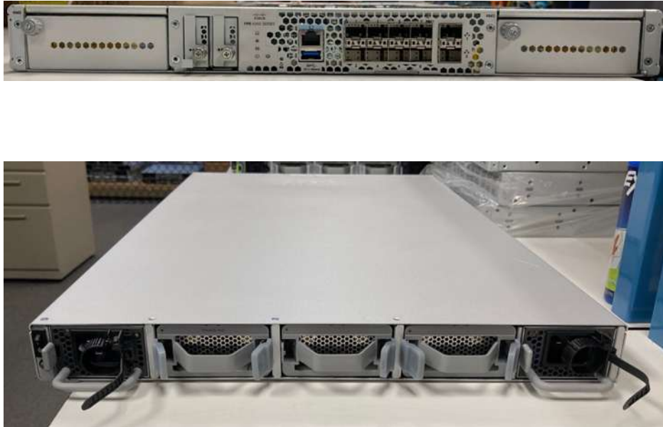
Figure 1: Cisco Secure Firewall 4200 Series Hardware (4215, 4225 and 4245)

The configuration consists of the following configuration: