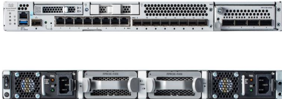
Figure 1: Cisco Secure Firewall 3100 Series Hardware (3105, 3110, 3120, 3130 and 3140)

The configuration consists of the following configuration: